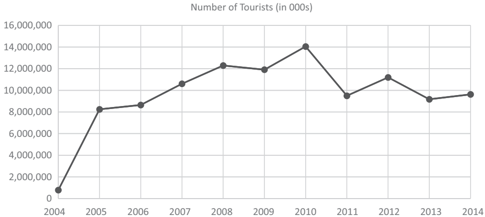
Figure 11.1 Tourist arrivals to Egypt from 2004 to 2014