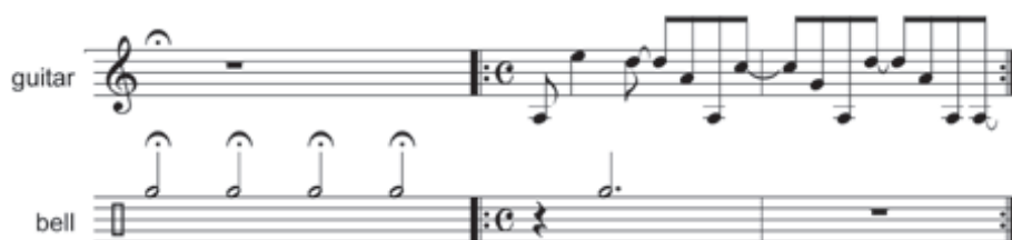
Figure 13.8 AC/DC, “Hell’s Bells”, introduction

direction: the guitar is displaced backward in time by a quaver, and the bell is displaced forward by a crotchet. Nonetheless, the contour and rhythm of the melody suggest a 4/4 metre, particularly in the absence of any other conflicting cues, so the destabilisation is a mild one.